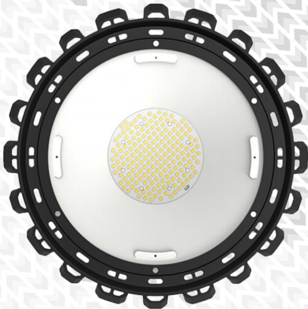
High-Grade Series Industrial High Bays